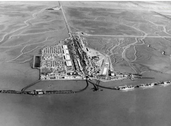
Fig. 4. Aerial view of Sarbandar and Camp B.