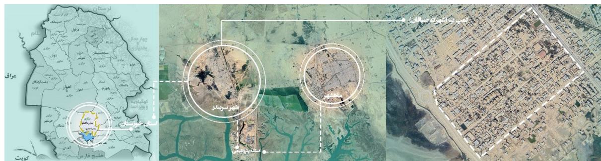
Fig. 3. Location of the Case Study.

Although the neighborhood is ethnically diverse, this diversity has not fostered cultural enrichment. Instead,