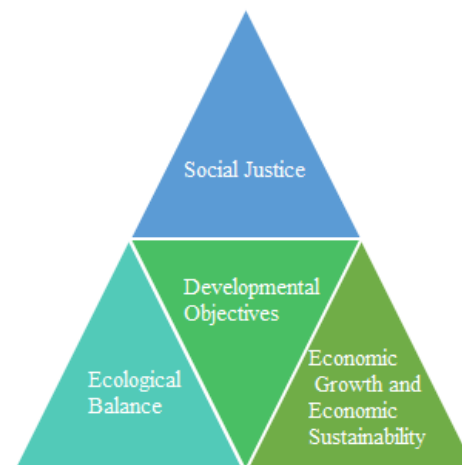
Fig. 2. Objectives of Place-Based Development.

Another viewpoint conceptualizes development as a form of “authoritarian intervention,” wherein planning occurs without genuine local participation and relies on predetermined indicators. Scott (2020), in Seeing Like a State , demonstrates how governments that disregard local contexts and the complexities of everyday life often implement projects that not only fail but also generate crises and public dissatisfaction. He attributes the failure of many such initiatives to oversimplification and neglect of local realities. Although recent decades have seen attempts to address these shortcomings through social, cultural, and environmental frameworks, the fragmented and instrumental nature of these policies has often limited