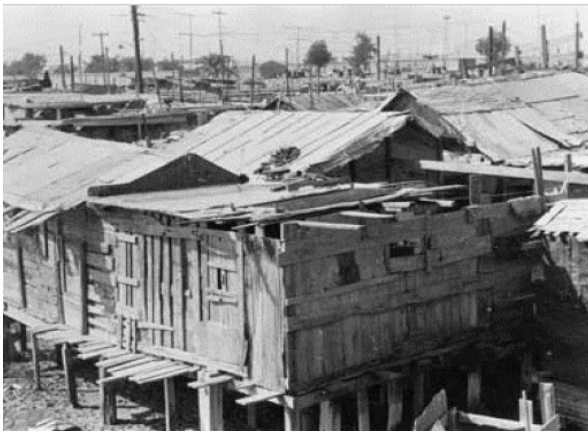
Fig. 5. Workers' housing in Camp B.