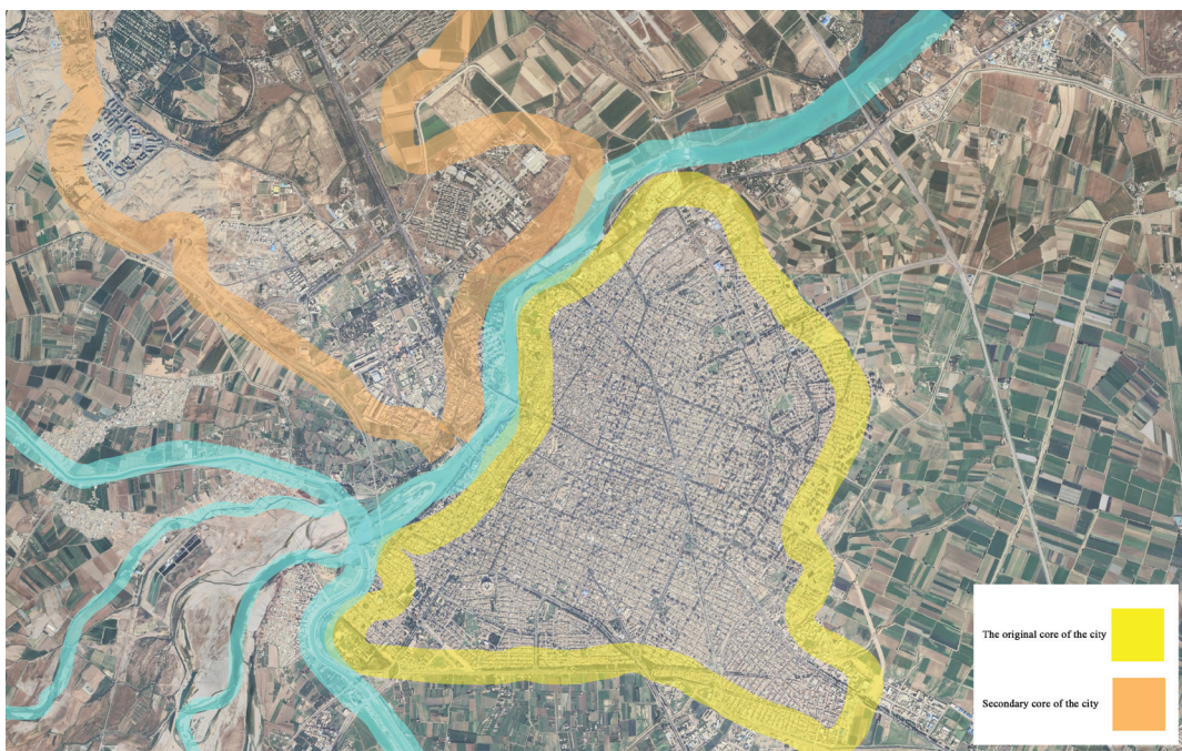
Fig. 3. Map of the primary and secondary cores of Dezful city.

Appreciating the spatial structure of the city in its historical context can contribute to the revival and revitalization of the old texture of the city. The reason is that in most cities, the main structure and foundation depend on the skeleton of their old part. The extension of the historical life of the city requires the regrowth of the city from its inside. Given the presence of the market and commercial activities, historical and cultural identity, tourist attractions of unique buildings within the texture,