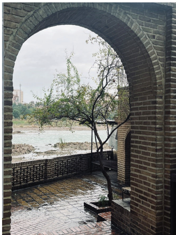
Fig. 3. Riverside collective spaces have the potential to offer quality space and foster interactions among nature, history, and society.

Finally, redefining the role of the Dez River in the spatial organization of Dezful can be considered as one of the main axes of sustainable urban development. By utilizing the ecological, visual, and social capacities of the river and enhancing its role in connecting the eastern and western parts of the city, it will be possible to recreate space and