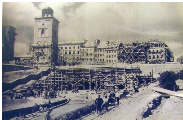
Fig. 4. An Old photograph of historical monuments in the reconstruction of Warsaw after the World War II. Photo: Ehsan Dizani, 2008, Historical images from the museum of Warsaw.