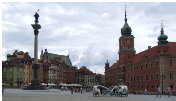
Fig. 3. The post-war reconstruction of the same historical building in Warsaw. Photo: Ehsan Dizani, 2008.