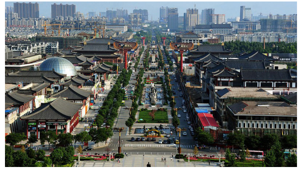
Fig. 1. The aerial view of the Tang-Paradise axis in Xi'an city over the historical Pagoda; An example of a historical-based approach in modern urban interventions by using ancient architecture.

Terminology and specialized expressions of urban planning have a basic role in applying concepts, progressing, and expanding approaches being used for urban interventions. The importance of these expressions and definitions in this field is targeted from two aspects: first of all, in scientific communities, the use of common definitions for implying scientific concepts is absolutely required. The presence of contradictory expressions and definitions can disrupt the transmission of concepts and complicate the understanding of specialized contentions. Secondly, the advancement and expansion of any scientific area require the foundation of relevant specialized background based on the related terminology and definitions. In other words, the presence of specialized expressions and terms allows the expansion and advancement of various sciences (Erfany & Dizani, 2019, 49.) In this study, the related expressions to the Tang Paradise project including "Reconstruction" and "Renovation" have been analyzed. In this study, the international conventions and related charters were addressed. The significance of these documents related to the cultural heritage of each country has been stated in Nara Document, Article 8 as follows: "It is important to underline a fundamental