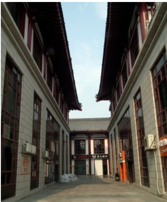
Fig. 8. Tang Dynasty architecture style, with huge new buildings that are built on both sides of the Tang-Paradise. Photo: Ehsan Dizani, 2010.

According to a research study, it has been shown that protecting identity and maintaining daily life is vital for tourism management in ancient cities (Wang, Lu, Xu, Wu & Wu, 2019, 415). But in the Tang Paradise Project the issue is completely the opposite, because for implementing this urban plan, everything left from the past architecture was completely removed except for the pagoda monument (Big Wild Goose Pagoda), and a new urban space was created. However, according to the “Venice Charter”, article 6: “The conservation of a monument implies preserving a setting which is not out of scale. Wherever the traditional setting exists, it must be kept. No new construction, demolition or modification which would alter the relations of mass and color must be allowed” (ICOMOS, 2006, 13).