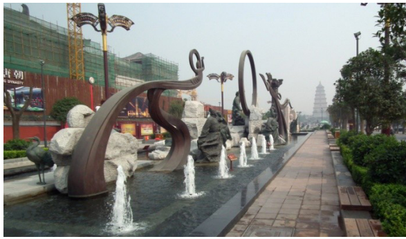
Fig. 6. Big Historical Goose Pagoda, the original monument in the Tang-Paradise.