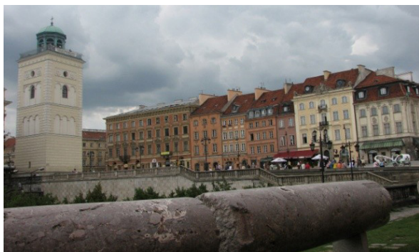
Fig. 5. The reconstructed historical monuments in Warsaw.