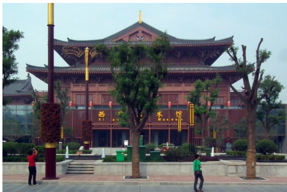
Fig. 7. Tang Dynasty architecture style, with huge new buildings that are built on both sides of the Tang-Paradise.