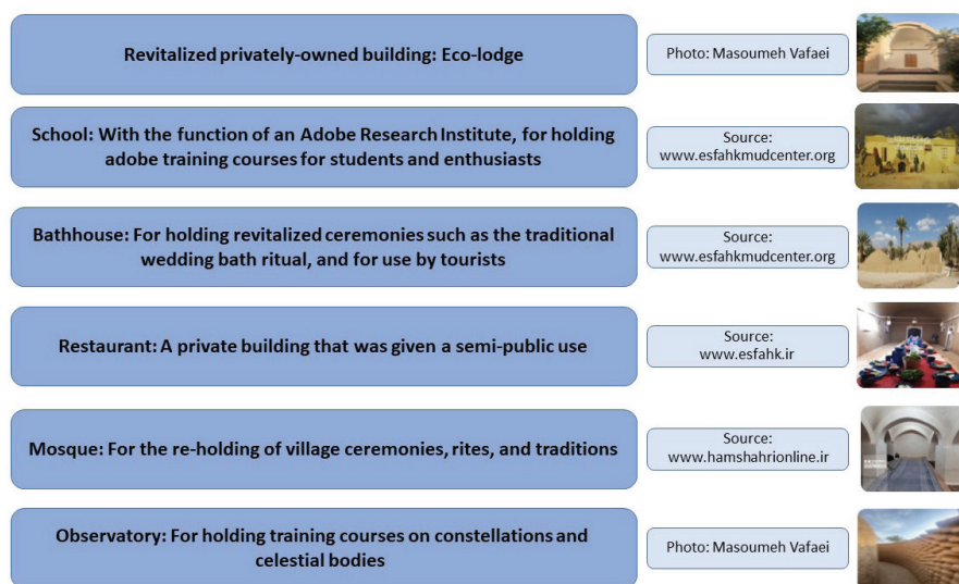
Fig. 4. Some revitalized buildings with new uses and images.

the practical horizons and validate this innovative approach in the management of human settlement revitalization.