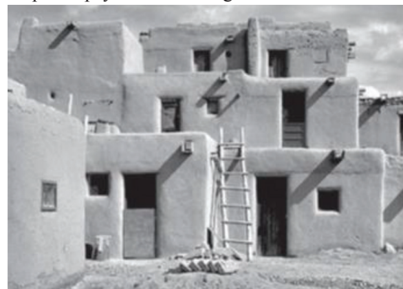
Fig. 1. Traditional Village.