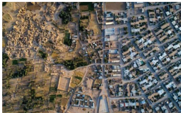
Fig. 2. Aerial view of New and Old Esfahk.

Human settlements, whether in rural or urban contexts, are considered the vital arteries of communities, providing the primary setting for life, social interactions, and cultural and economic development. Given the escalating