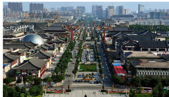
Fig. 1. The aerial view of the Tang-Paradise axis in Xi'an city over the historical Pagoda; An example of a historical-based approach in modern urban interventions by using ancient architecture.

Terminology and specialized expressions of urban planning have a basic role in applying concepts, progressing, and expanding approaches being used for urban interventions. The importance of these expressions and definitions in this field is targeted from two aspects: first of all, in scientific communities, the use of common definitions for implying scientific concepts is absolutely required. The presence of contradictory expressions and definitions can disrupt the transmission of concepts and complicate the understanding of specialized contentions. Secondly, the advancement and expansion of any scientific area require the foundation of relevant specialized background based on the related terminology and definitions. In other words, the presence of specialized expressions and terms allows the expansion and advancement of various sciences (Erfany & Dizani, 2019, 49.) In this study, the related expressions to the Tang Paradise project including "Reconstruction" and "Renovation" have been analyzed. In this study, the international conventions and related charters were addressed. The significance of these documents related to the cultural heritage of each country has been stated in Nara Document, Article 8 as follows: "It is important to underline a fundamental