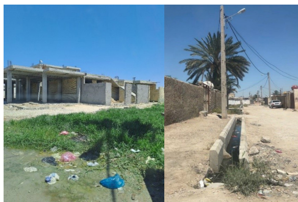
Fig. 1. Images of the neighborhood, the incomplete Housing Foundation building, improper waste collection, and inadequate basic and superstructure infrastructure.

roots of a foreseeable failure. The foundation of the project's failure lies in a dysfunctional governance