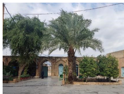
Fig. 2. The Jujube and palms of selected native trees are present from public spaces to home yards.