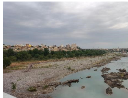
Fig. 1. Transforming the waterfront into a park-like space with recreational functions and its separation from urban life, Dezful.