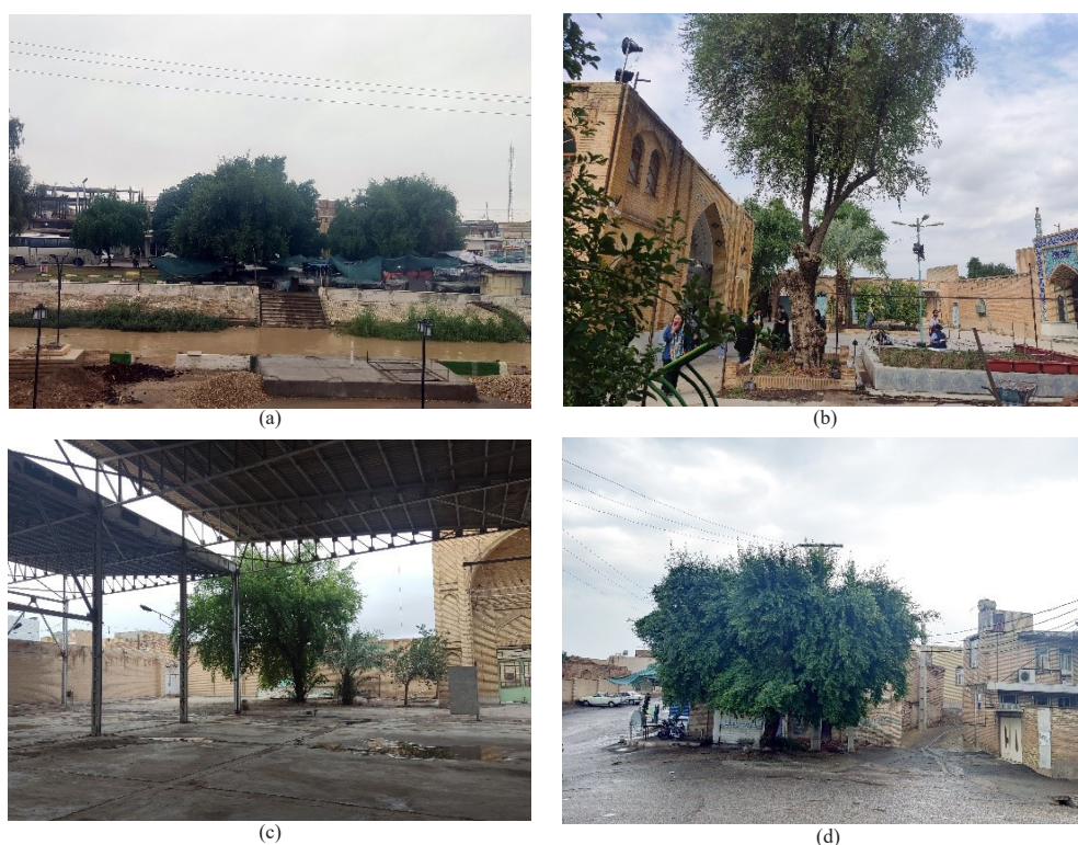
Fig. 4. Examples of organizing the native green landscape as an oasis. A) A green oasis in front of the tomb of Daniel the Prophet of Shush, B) Organization of an oasis in the area of the tomb of Shah Rokneddin of Dezful, C) Remaining trace of the green oasis landscape of the Grand Mosque of Shushtar, D) A Jujube specimen tree next to the symbol of organizing the oasis of Dezful. Photo: Babak Abdi, 2024.

points where social interactions and daily activities of residents take place, therefore the urban green landscape has been formed in continuous connection with the life context of the city residents. The trees planted at these landmarks are selected native trees that have a deep connection with the minds, identities, and beliefs of the residents, and their merely visual aspect has not been considered. With the multifunctionality of trees and the increase in the semantic layers and the role of trees in people's lives, these trees act as an element in the landscape, and this type of native green landscape has an aesthetic perception in the minds of the residents, and as a result, it causes a sense of belonging to the place. Finally, it can be said that the native green landscape in the river cities of Khuzestan meets the needs of the residents due to its compatibility