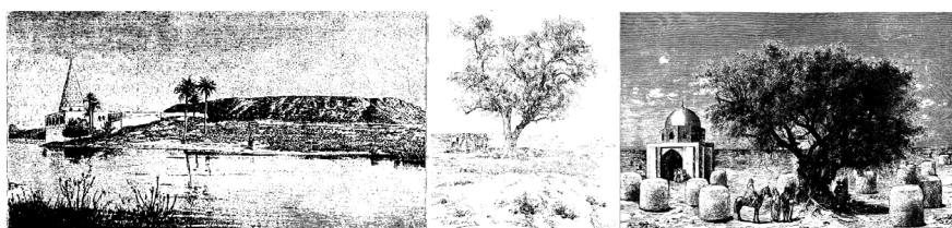
Fig. 3. The presence of a specimen Jujube tree near the Imamzadeh and a Palm tree near the tomb of Daniel the Prophet indicates the sacred status of these trees.

the sacred tree. In addition, the placement of this tree in a sacred place and its association with religious ceremonies and pilgrimages adds to the sacred status of these trees. This association and continuous presence of these sacred trees in religious beliefs and ceremonies are linked to the identity of the residents, and the role of these trees in the lives of the residents becomes an identity-giving element beyond just a natural and plant element.